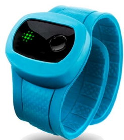
X-Doria KidFit Activity and Sleep Tracker